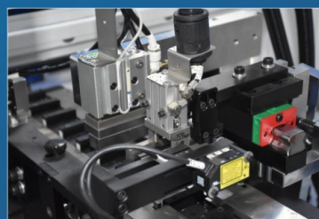
Press fit mechanism

COPYRIGHT © 2025 GEREKE. ALL RIGHTS RESERVED